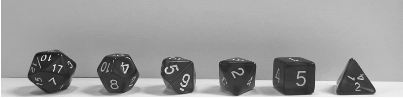
Figure 0.1 A set of tabletop role-playing dice

Figure 0.1 shows a set of tabletop role-playing dice. From left to right they are: d20, d12, d10, d8, d6 and d4. The numerical value indicates how many sides each dice has. So, for example, the second dice from the left is a d12 and it has 12 sides.